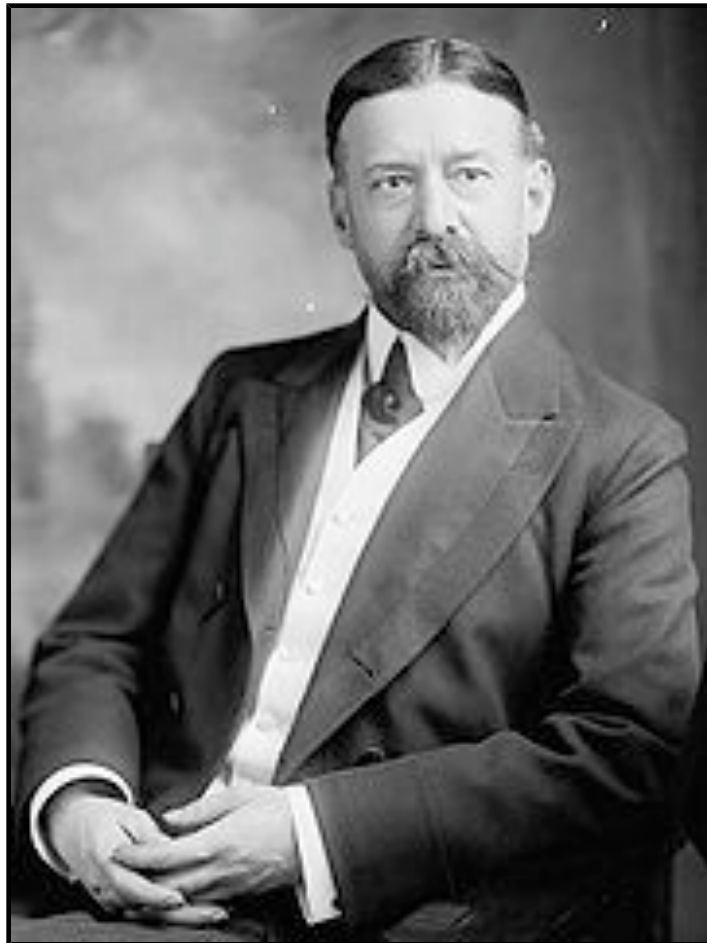
James Creelman: yellow journalist In China

HUMAN RIGHTS JOURNALISM AND THE "YELLOW" SEEDS OF WAR WITH SPAIN