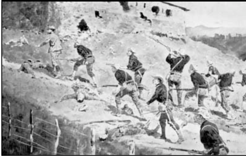
The Assault on El Caney